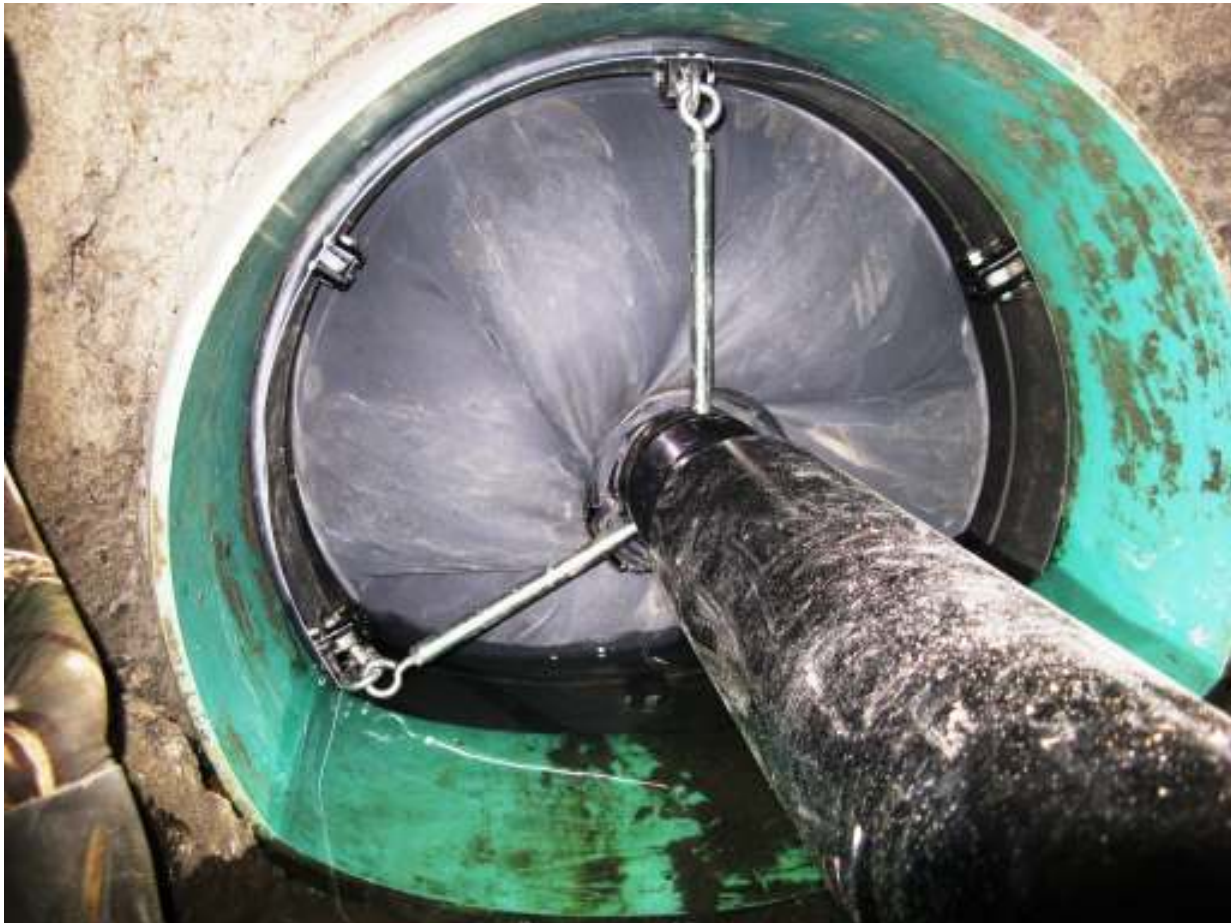
Figure 2- WI-Plug deployed within a 21" pipe

WI-Plug: The WI-Plug can be installed with no change of infrastructure in any location regardless of pipe size (up to 30”), orientation or location. It can be installed in horizontal or vertical pipes and can be installed underground at any depth. The installation is non- invasive and requires no flanges, pipe cutting or changes of infrastructure. Installation is easy and generally takes under one hour. The WI-Plug can be tailored to an assortment of chemicals. The intelligent WI-Plug system will report to the user, via email, if the system requires maintenance or battery change. It will also report on the success or failure of the plug deployment. Figure 2 depicts a deployed plug in a 21” pipe. The plug was activated from the control room 150’ away during an actual spill (water simulation).