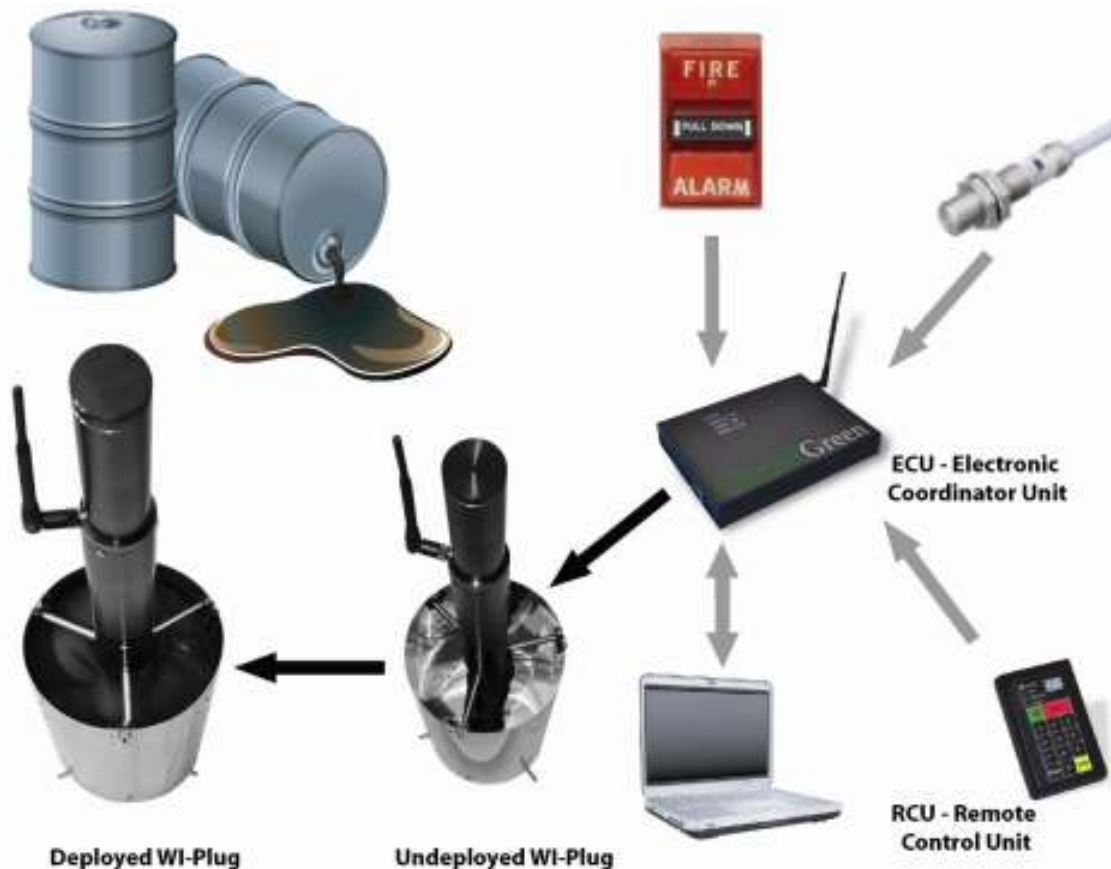
Figure 1- System layout

Due to the fact that the WI plug substantially reduces the environmental risk involved in chemical spills, it is likely to reduce the costs of training personnel as well as insurance costs.